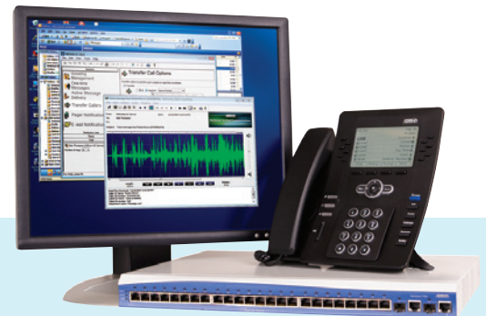
NetVanta Unified Communications System— NetVanta 7100 and IP Phone